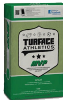
Turfce's MVP conditioner.