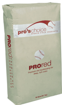
Pro Choice's Pro Red Conditioner