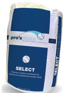
Pro Choice's Select Conditioner