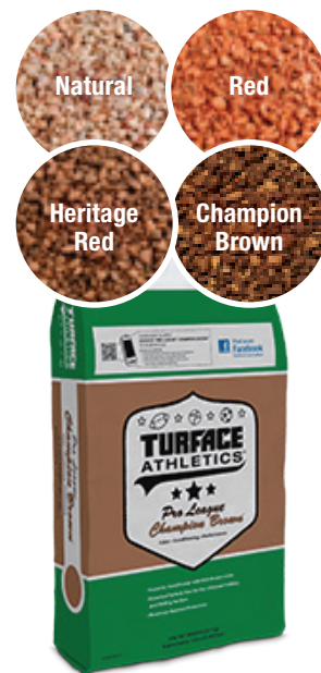
Turfce's Pro League Conditioner comes in four color choices: Natural, Red, Heritage Red and Champion Brown.