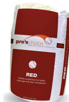
Pro Choice's Red Conditioner