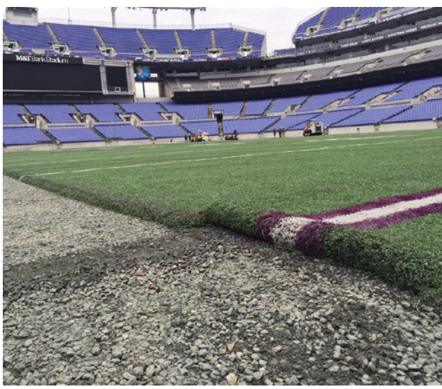
The Motz Group workers dug out 6 to 8 inches of crushed rock at M&T Bank Stadium — as well as the old rootzone — to reach the gravel layer, including the drain tiles and underground heating system that keep the field playable even in wet and freezing weather. The new 12-inch root zone, consisting of 90 percent sand, 5 percent native soil and 5 percent peat, was built on top of the existing gravel blanket.